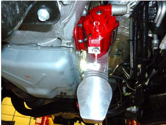
Bolt the "HYDRA-DRIVE" to the PTO*