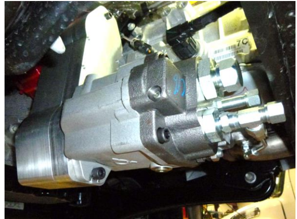
Bolt the hydraulic pump to the "HYDRA DRIVE"*