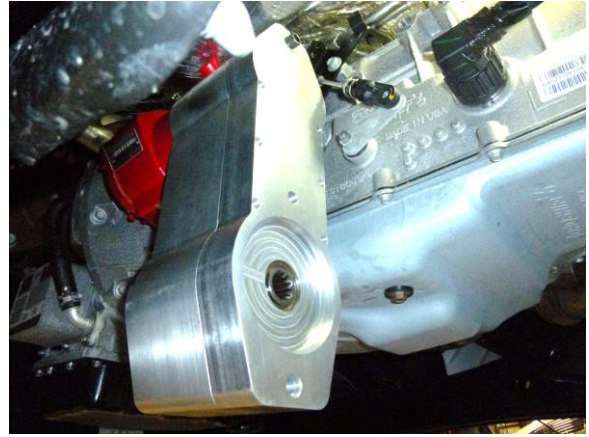
Bolt the "HYDRA-DRIVE" to the PTO*