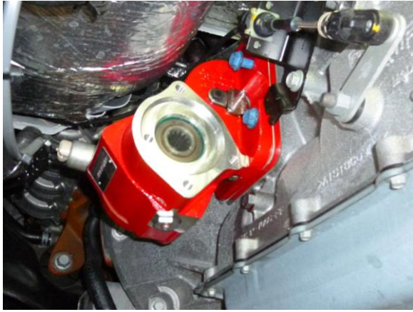
Bolt the PTO to the transmission*